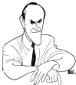
Jim Lebenthal (as captured by Al Hirschfeld)