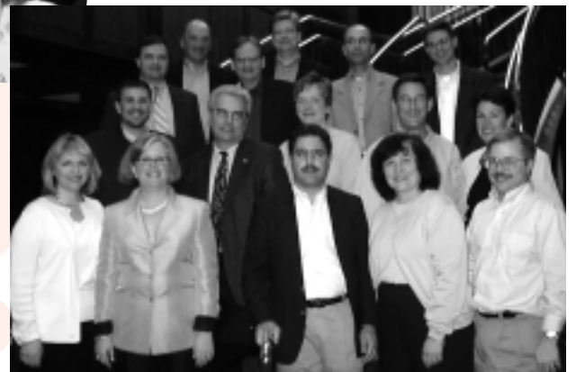
Members of the 2002 NFMA Board of Governors