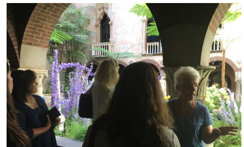
Gardner Museum Tour

BMAF'ers kicked off the summer on June 22nd with our annual Golf Outing at Granite Links sponsored by Build America Mutual, where members enjoyed 18 holes of golf followed by a cocktail reception. On August 23rd, we paid a visit to one of Boston's premier tax-exempt organizations: the Isabella Stewart Gardner Museum. Our guided tour included a discussion of the highlights of the collection and the main galleries as well as an introduction to the new wing, which was partially financed with tax-exempt bonds. Afterwards, we gathered on the patio at Yard House in Boston's Fenway neighborhood for drinks and appetizers.