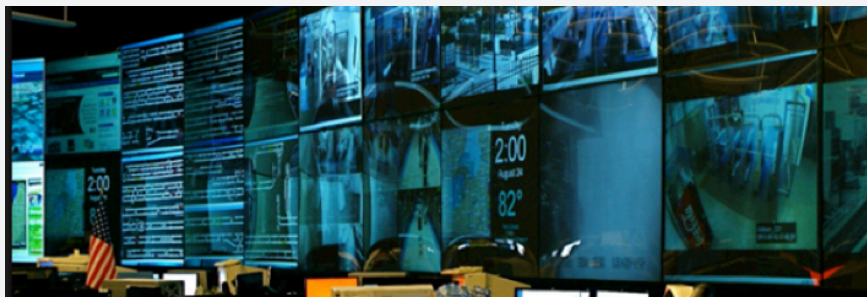
(CTA Control Center: photo from public sources)

In response to positive feedback from members, the CMAS board is committed to planning more site visits. This year, we visited the Chicago Transit Authority Control Center. The Control Center is where CTA controllers monitor service, power and safety for Chicago's trains, buses and transit stops in real-time on an enormous wall of monitors. Members left impressed with the scope of managing the second largest public transit system in the country.